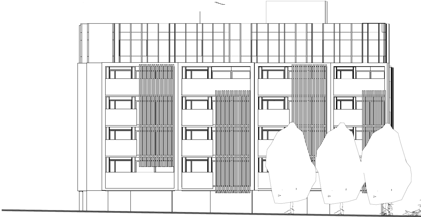
Front Elevation SCALE 1'-0" = 1/16"